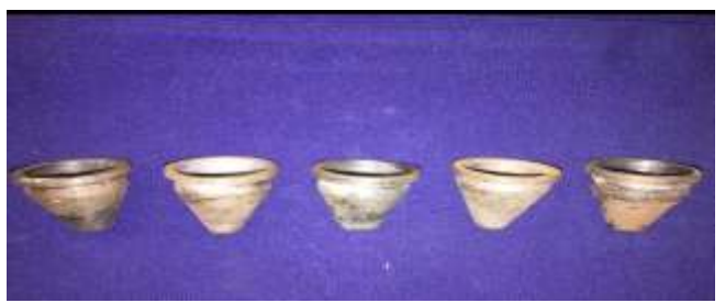
Fig.3.Nozzle Of Different Diameters