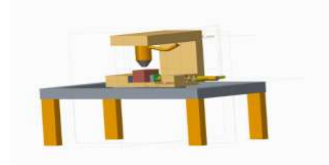
Fig.1.The Abrasive Jet Machine